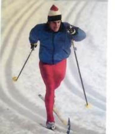
1985 U.S. CROSS COUNTRY SKIING NATIONAL CHAMPIONSHIPS MARCH 19 - 28, 1985